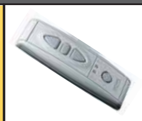
Optional Remote control

The HAROL SS Series are compact folding arm awnings with its own specific contemporary designs. Attention to technical details ensures years of trouble free operation.