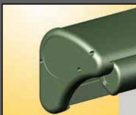
Attention to function & form